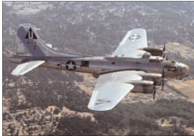
The famed B-17

The losses inflicted by Big Week were not crippling, but definitely tipped the scales of air superiority toward the Allies. Over the next few months, the Germans would lose thousands of additional planes through combat and accidents. By May, the Allies had effectively won control of the air.