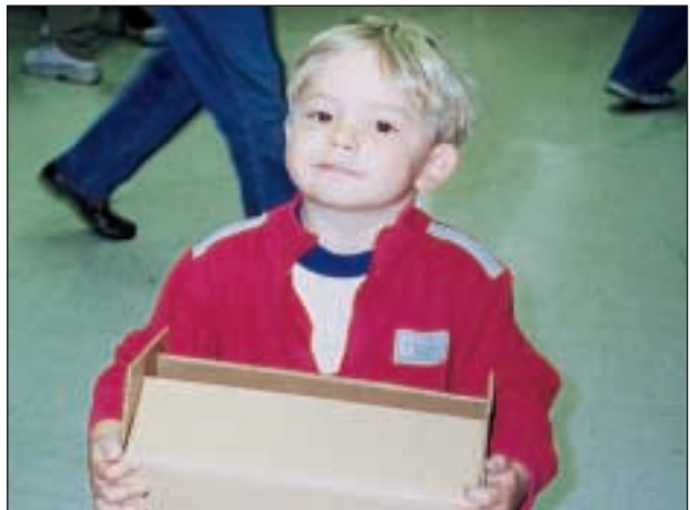
One of the younger helpers.