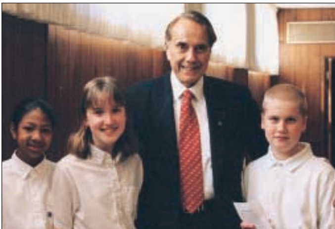
Senator Dole with three of the students from St. Hugh's School in Greenbelt, Md., who collected more than $1,300 for the memorial.