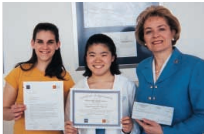
Rep. Marcy Kaptur accepts a check to the memorial for $3,878 from Dakota Hills Middle School in Eagan, Minn.