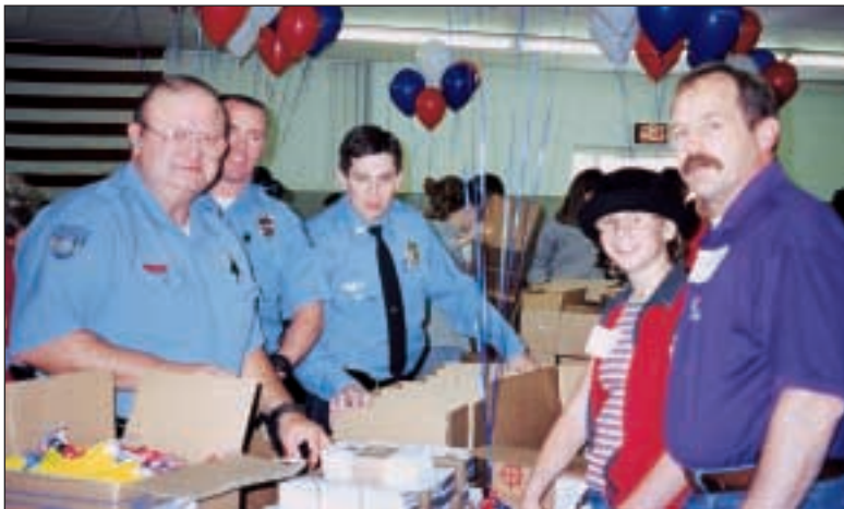
Event volunteers included members of the local police force.